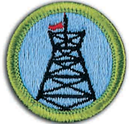
Scout Pioneering Badge

We must continue to make safety a part of everything we do – both on and off the job. I am approaching my new responsibility as chair of the S&H Committee with this in mind,